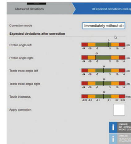
Fig. 2: Process control with the integrated Closed Loop system

Requirements in the age of Industry 4.0 go far beyond this, however: It's not “just” about ensuring the necessary workpiece geometry – it's about traceability and optimization of the complete