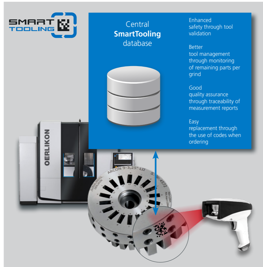
Fig. 4: SmartTooling